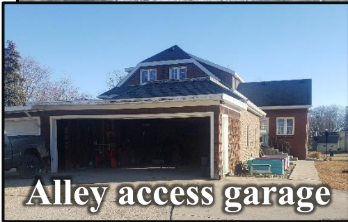
Alley access garage

4 BR/ 2 Bath Utilities: City of Hartley Year Built: 1924 Sq Ft: 3,062 Lot: 128 x 148